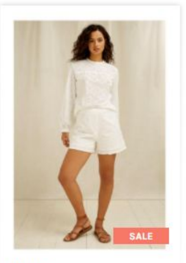
People Tree Nova Broderie Shorts In White