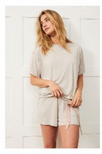
Cucumber Clothing Shirred Shorts in Fawn